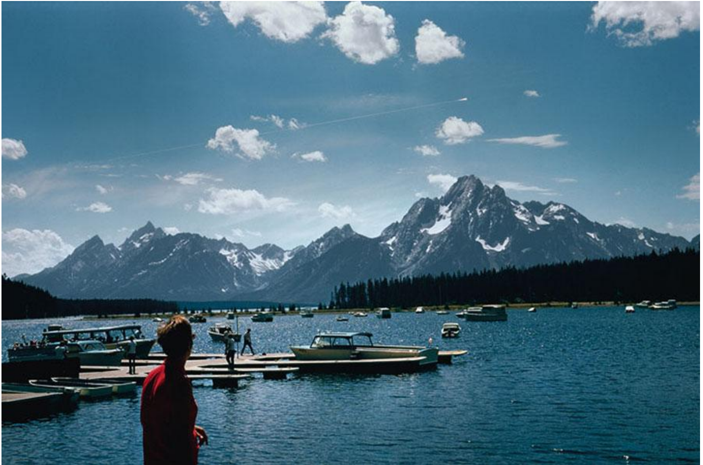
Earthgrazer: The Great Daylight Fireball of 1972

(Wilfred Grenfell, English medical missionary, 1865 - 1940)