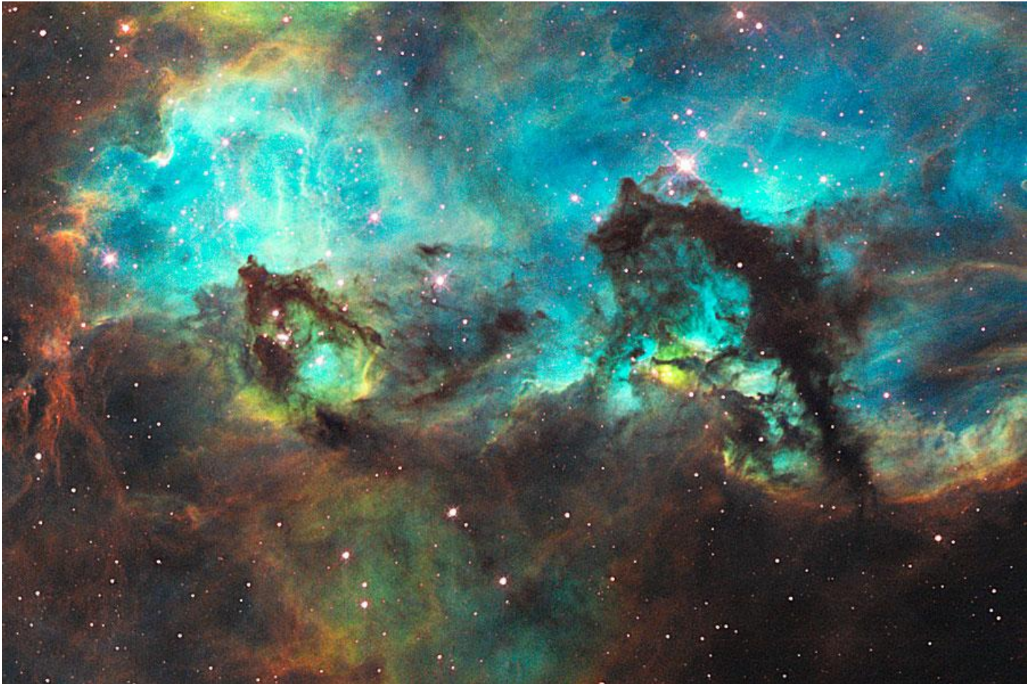
The Seahorse of the Large Magellanic Cloud

— Denis Waitley : Author and productivity