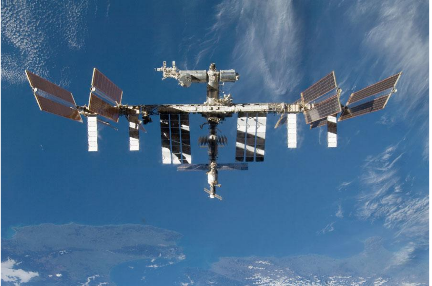
The International Space Station Over Earth

(Antoine de Saint-Exupery, French aviator and writer, 1900-1944)